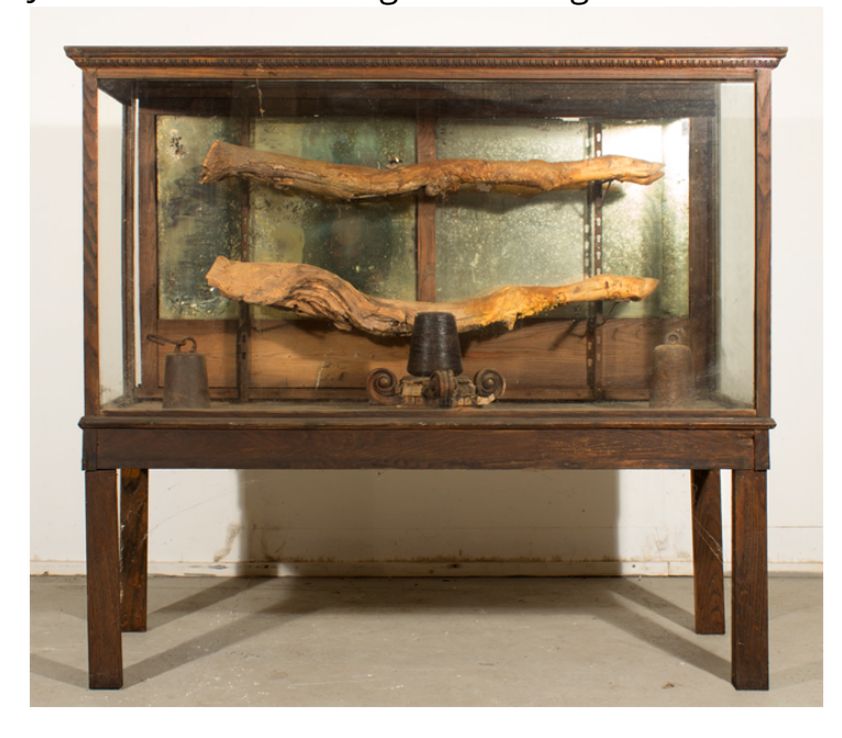
Don DeMauro "Regions of the Body" 1999