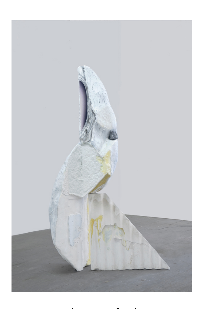
MaryKate Maher "Map for the Temporary Inhabitant" White Stone